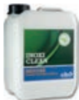
InoxiClean Restore 1.32 gal.