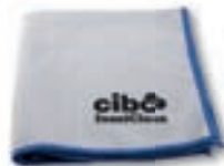
Microfiber cloth extra fine