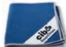
Microfiber cloth fine