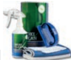
InoxiClean Restore Set