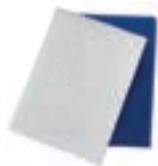
Tex 00 sheet 5.5" x 4"